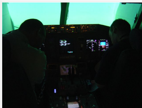
possibly due to late arrival of the flight crew... lazy gits!